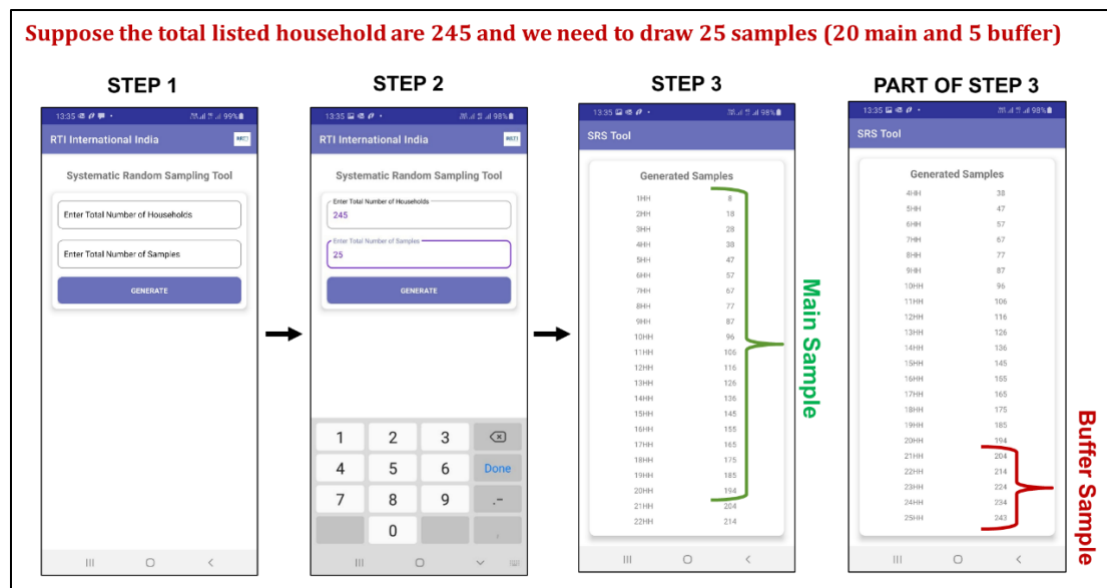
Figure 5. Drawing of Sample Using SRS App (Example)